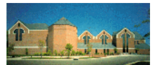
Hampton Public Library Victoria Blvd.